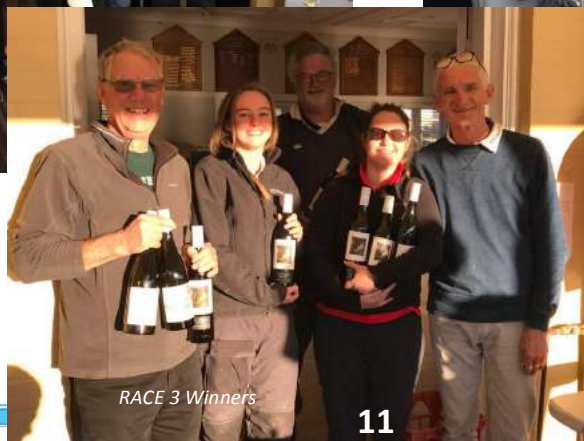
RACE 3 Winners