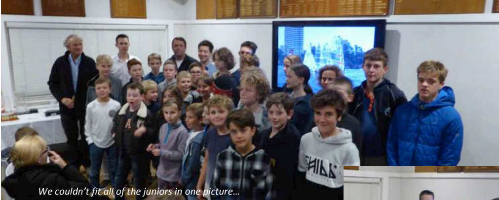
We couldn't fit all of the juniors in one picture... So we had to take two...