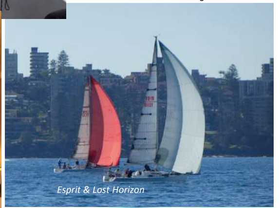
Esprit & Lost Horizon