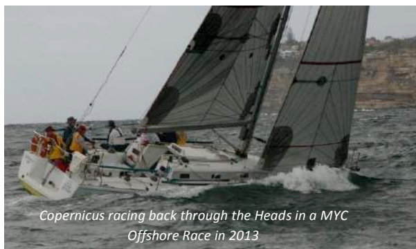
Copernicus racing back through the Heads in a MYC Offshore Race in 2013

In addition to our usual race programme, we're looking to re-invigorate the Offshore Series, with a planned series of three races based on the traditional concept of 'a wee quiet drink' passage racing, i.e. have a friendly race to a destination that can provide a good pub meal! Keep the boat there overnight and then have another friendly race back home again the next day after a leisurely cooked breakfast.