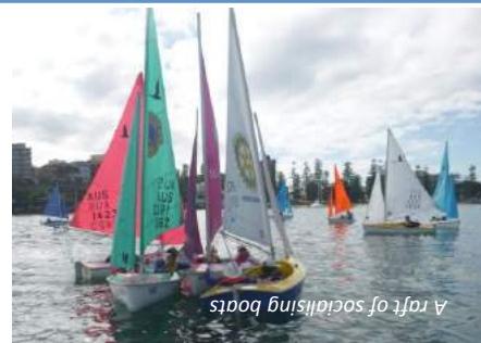
A raft of socialising boats

The whole day was dependent on 6 303's being brought over from Middle Harbour. Thank you so much, Middle Harbour, this was a big ask, and a great learning experience for both Middle Harbour Branch and Manly Branch. It opens up a whole realm of possibilities, now that we know that we can do it, and it will get easier with practice.