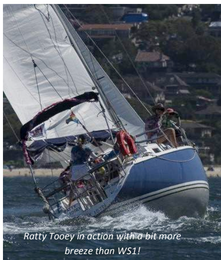
Ratty Tooey in action with a bit more breeze than WS1!

In fact, it was a particular pleasure to see Ratty Tooey absolutely nail the start line to the second. Too bad that: