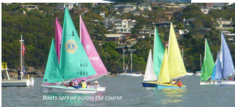
Boats spread across the course