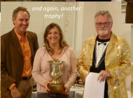
... and again, another trophy!