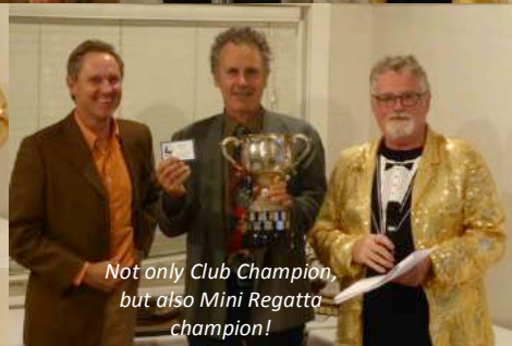
Not only Club Champion, but also Mini Regatta champion!