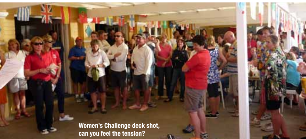
Women's Challenge deck shot, can you feel the tension?