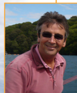
The Fowey Gallants club - Not a bad spot to spend the afternoon