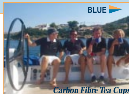
Carbon Fibre Tea Cups