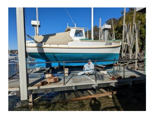
Bruce, hard at work keeping Carlyle looking "spiffy"