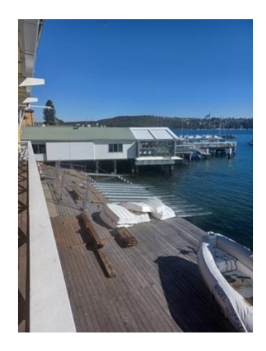
New ramp at the skiffies coming along