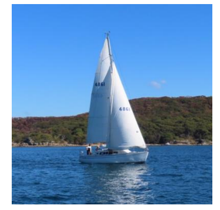
Micron with Team Oka on board

On a hot Winter's day with a forecast of light W-NW breezes, the Race committee sent the 2 divisions on Course 7 which sent the fleets to Cannae before division 1 diverged to Nielson Park AS while division 2 took off around Sow and Pigs. Both fleets then headed to Grotto Point before their final destination back to Manly.