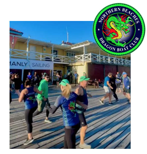
Warm up routine at the dragon boaters