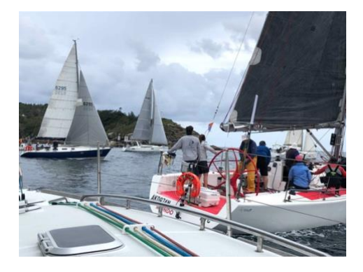
Perfect kite set for Ludicrous Mode

Results here: <u>https://app.sailsys.com.au/club/23/results/series/1818/races</u>