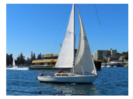
Great to see Bokarra out on the water. Congratulations on your grand prize draw!

Results here: https://app.sailsys.com.au/club/23/results/series/1818/races