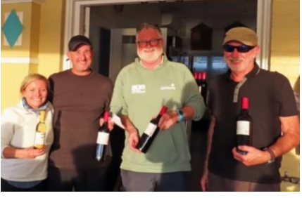
Division 2 winners