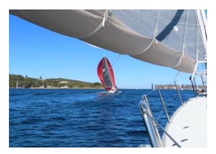
Going to be hard to catch