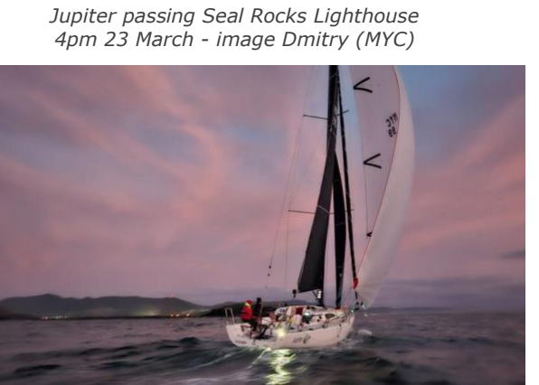
Jupiter heading to the finish and the overall win