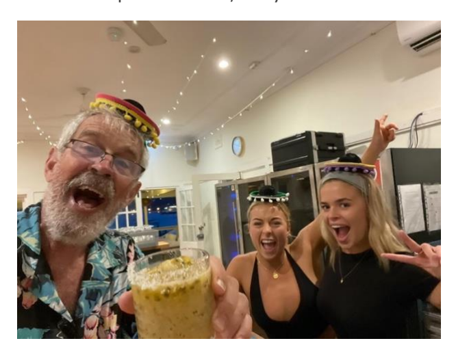
Quality control ...