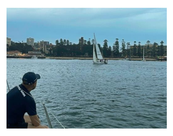
Madama Butterfly finishing