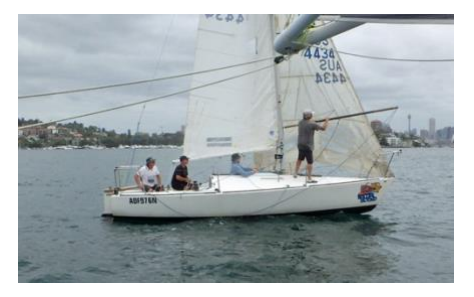
Waterhound after Rose Bay mark

It looks like Okavango Delta is still on top of the leader board, with Misky and Stock Car fighting for the other 2 spots on the podium.