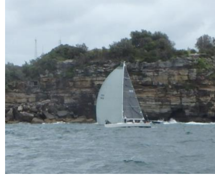
Lost Horizon under kite along the western shore