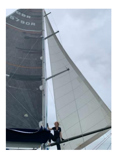
...To this images Cary Budd

John on Kryptonite commented ... "Although a short course, the strong straight southerly and swell through the heads made for a good race with a number of tacks to Chowder Bay North. Add 3 cruisers leaving as well, meant some yachts had to make some detours. Great race all round."